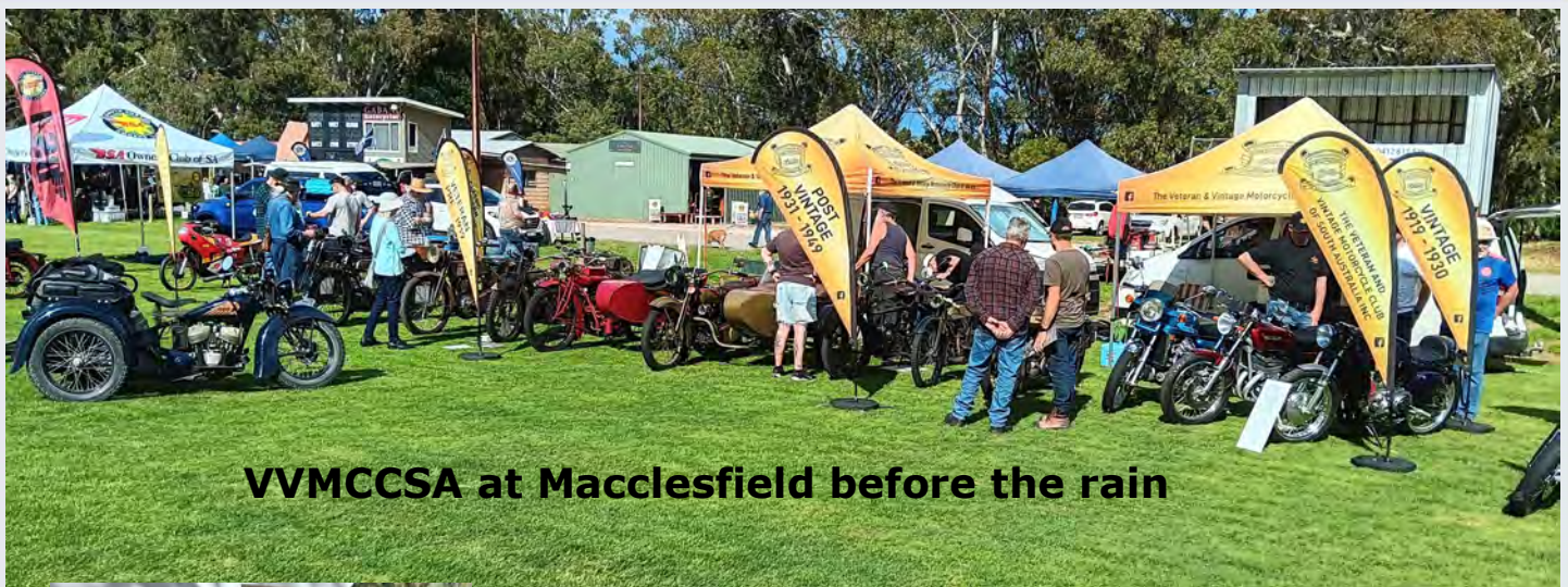
VVMCCSA at Macclesfield before the rain