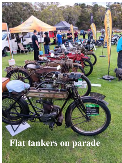
Flat tankers on parade