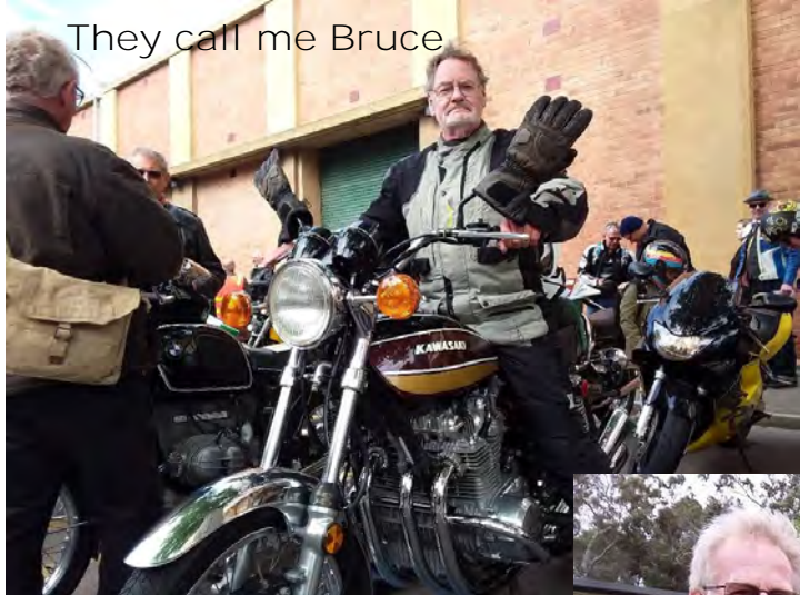
They call me Bruce