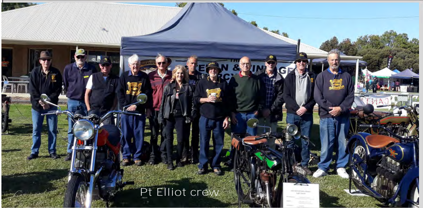
Pt Elliot crew