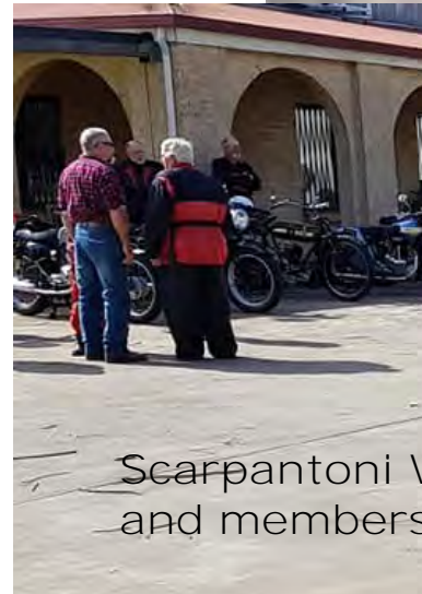
Scarpantoni Winery and members