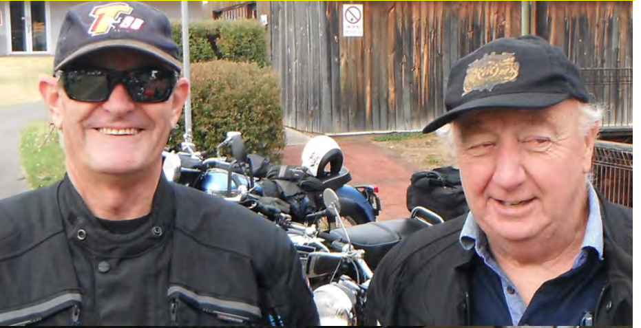
Birdwood figure 8 members