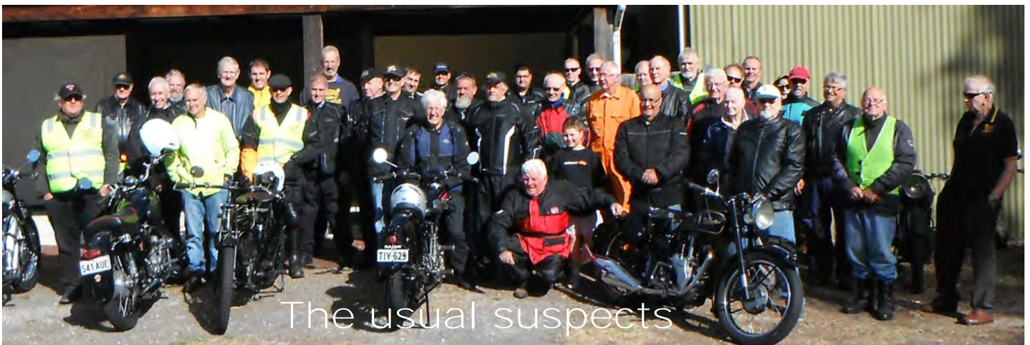
The usual suspects