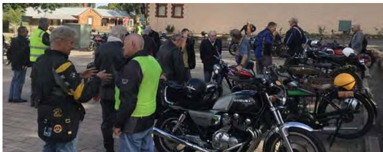
Members at Williamstown hotel stop

Meeting closed and at 8.40pm followed by an excellent supper.