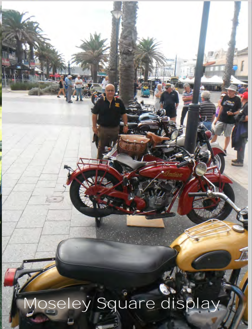
Moseley Square display

2017-2018 Membership subscriptions now due 23 April—Strathalbyn— Goolwa ride to wooden boat festival.