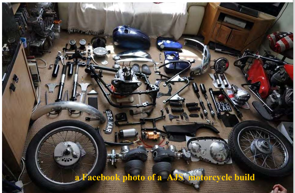
a Facebook photo of a AJS motorcycle build