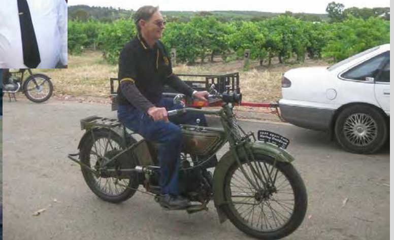
All British Day—12th February 2017 – Echunga Oval, Echunga. Kersbrook Tiddler ride 19th February 2017