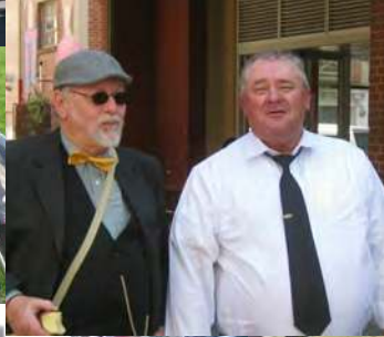
Distinguished Gentlemen's of VVMCCSA