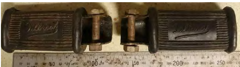
Tilbrook foot pegs