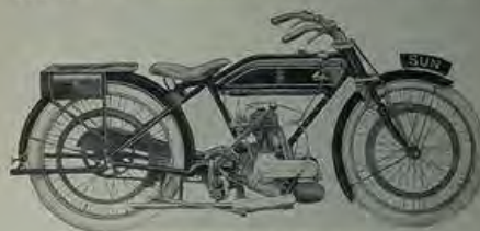
300 c.c. JAP Engine Model, All Chain Drive.

JAP 293 c.c. and 300 c.c. Engines and 350 c.c. Blackburne Side Valve Engine.