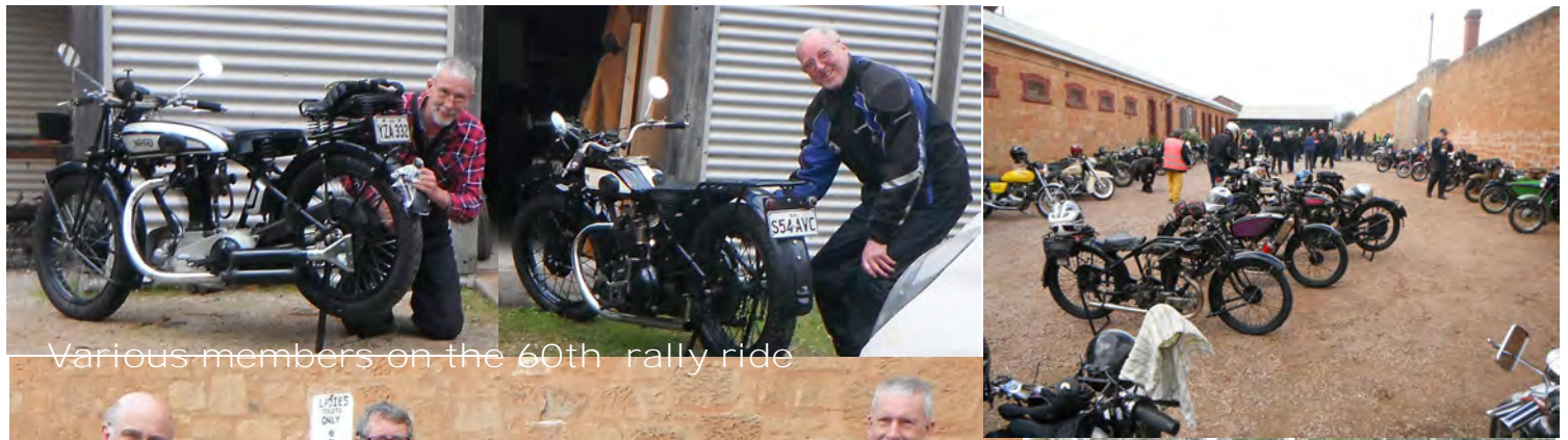
Various members on the 60th rally ride