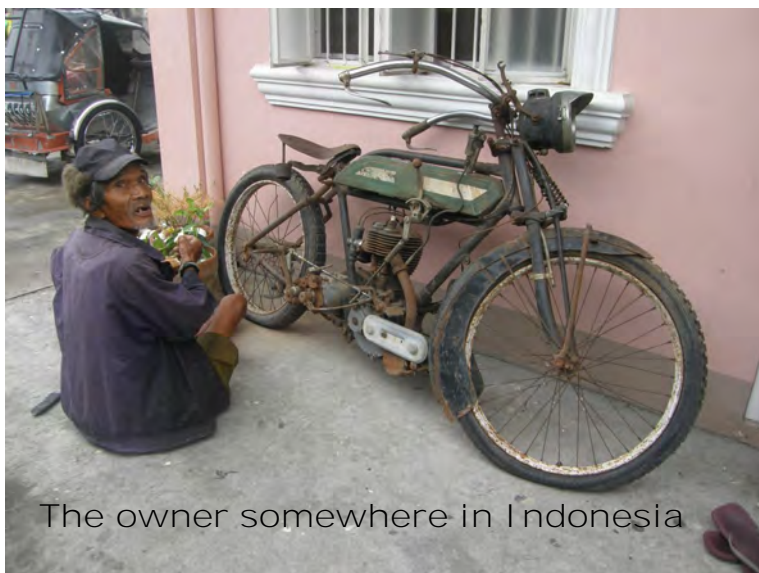
The owner somewhere in Indonesia