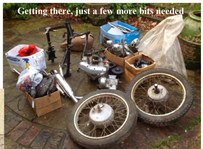
Getting there, just a few more bits needed