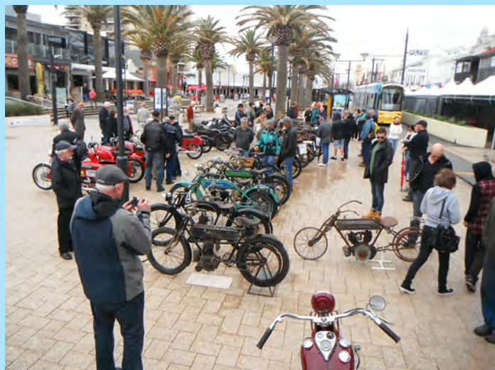
Australian Made motorcycle jamboree Birdwood 60th Rally committee members. Seen each day at the rally start.

Official Magazine of the Veteran and Vintage Motorcycle Club of South Australia (Inc) Established in 1956