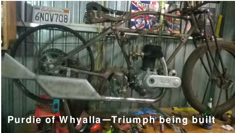
Purdie of Whyalla—Triumph being built

I understand about 20 members attended and enjoyed the breakfast. Unfortunately one member's motorcycle expired and was carried home.